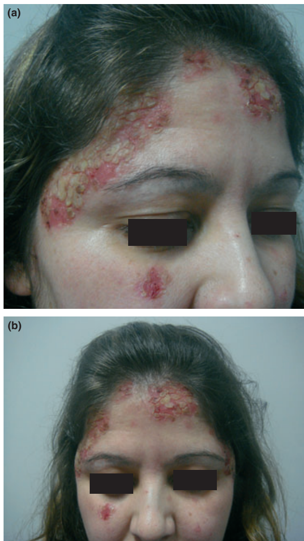
Figure 1 (a) and (b) Pemphigus vulgaris: lesions on the face despite combination therapy

Rituximab results in the depletion of normal as well as malignant B cells, leading to investigation of its use in autoimmune disorders, particularly in the treatment of systemic lupus erythematosus 4 and rheumatoid arthritis. 5 Although there have been no randomized controlled trials of rituximab in dermatologic disease, case reports describe its use in PV, paraneoplastic pemphigus, epidermolysis bullosa acquisita, cutaneous B-cell lymphoma, dermatomyositis, graft-versus-host disease, Wegener's granulomatosis, microscopic polyangiitis, cryoglobulinemic vasculitis, and Churg–Strauss syndrome. 6