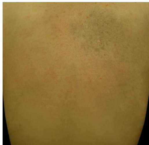
Figure 1 Macular blue-grey hyperpigmentation of the right side of her upper back and shoulder.

There are several hypotheses to explain the pathogenesis of acquired dermal melanocytosis. 1-7 One hypothesis is that dermal melanocytes migrating from the neural crest during the embryological development fail to reach their location in the basal layer of epidermis. In addition, dermal melanocytes may migrate from the basal layer of the epidermis or from hair bulb to dermis. 1-7-10 Other hypothesis is that reactivation of pre-existing, latent dermal melanocytosis, may be activated by inflammation, trauma, pregnancy, hormone replacement therapy