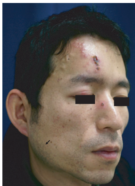
Figure 1 Clinical finding: skin lesions on the face and enlargement of the parotid gland