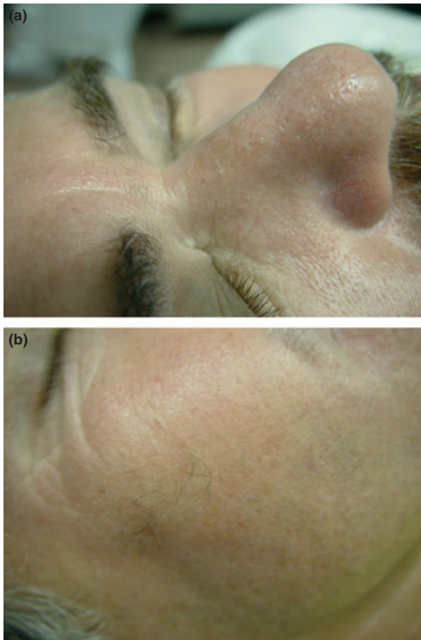
Figure 3 Appearance after PDT. (a) Patient 1. (b) Patient 2

CM is a rare cutaneous deposition disease that frequently involves areas of chronic sun exposure. 1,2,4 It was first described in the medical literature by Wagner in