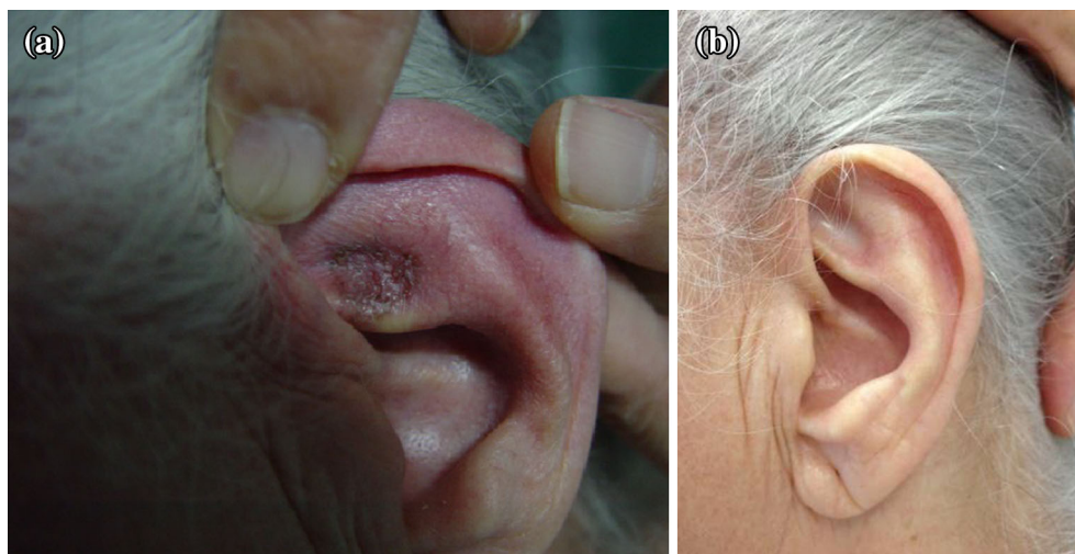
Fig. 1 A basal cell carcinoma localized on the antihelix of the ear and treated with photodynamic therapy. a Lesion before treatment. b Follow-up after 5 years